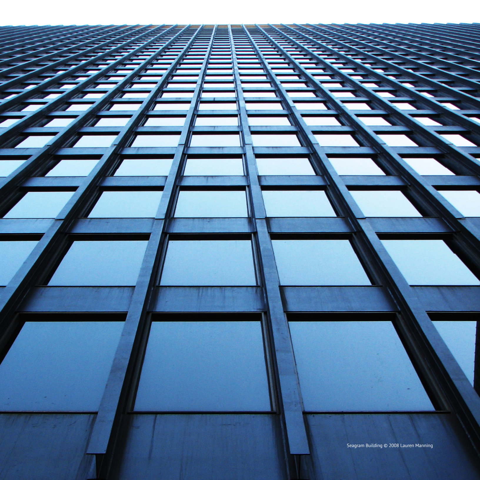
Seagram Building