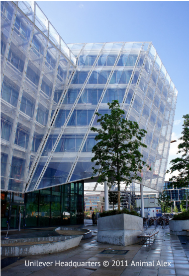
^ 7 FIGURE 5 The Unilever Headquarters in Hamburg, Germany includes an ETFE Pneus double-skin facade.